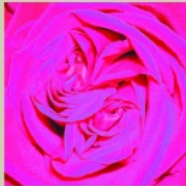
(Graphically enhanced thumbnail of cover photo)